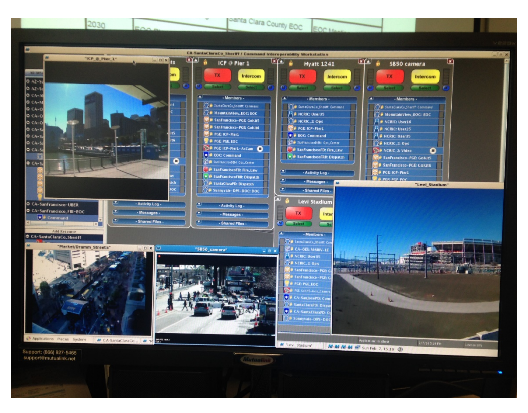
Mutualink at Sunnyvale Joint Information Center (JIC)